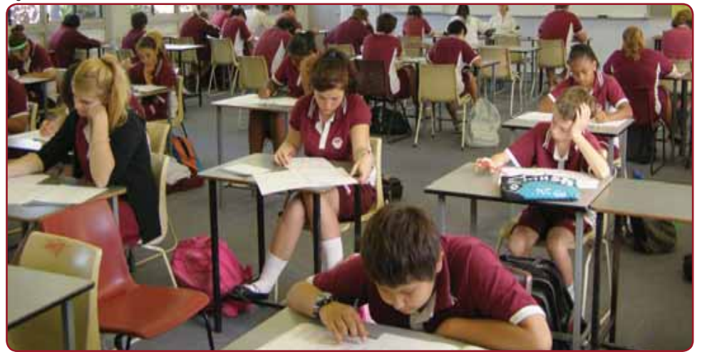
TEST CONDITIONS DURING THE AUSTRALIAN MATHEMATICS COMPETITION